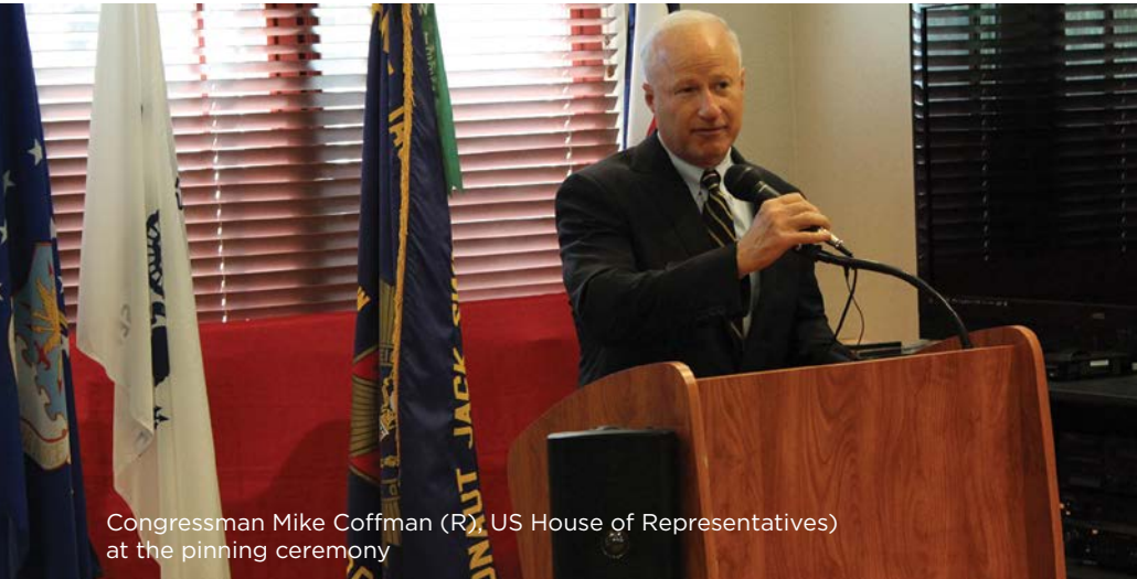
Congressman Mike Coffman (R), US House of Representatives) at the pinning ceremony

As the first Level Four Partner (highest level) We Honor Veterans program participant in the area, The Denver Hospice takes great pride in honoring Veterans.