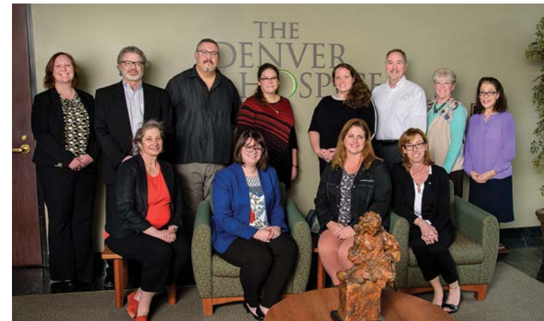
The Denver Hospice and Optio Health Services Clinical Managers and Directors

But just what is palliative care? Our palliative care program offers those facing a serious or chronic illness with a team of professionals who provide coordinated care to address a patient's physical, psychological, social and spiritual needs. Our services offer an extra layer of medical and social support appropriate at any age and at any stage in a serious disease. Our teams provide care wherever needed. It is a model that has proven effective in reducing the "ins and outs of hospital stays" and oftentimes improves quality of life.